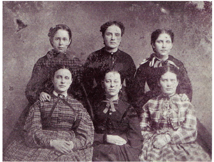
Women of the Antebellum South, Courtesy of the Museum of the Confederacy, Richmond Virginia

Some women visitors served as nurses for a few days and then departed. Nevertheless, many women volunteers were devoted caretakers and their contributions were significant. Many Civil War histories refer to women visiting hospitals but do not classify them as nursing staff. These women