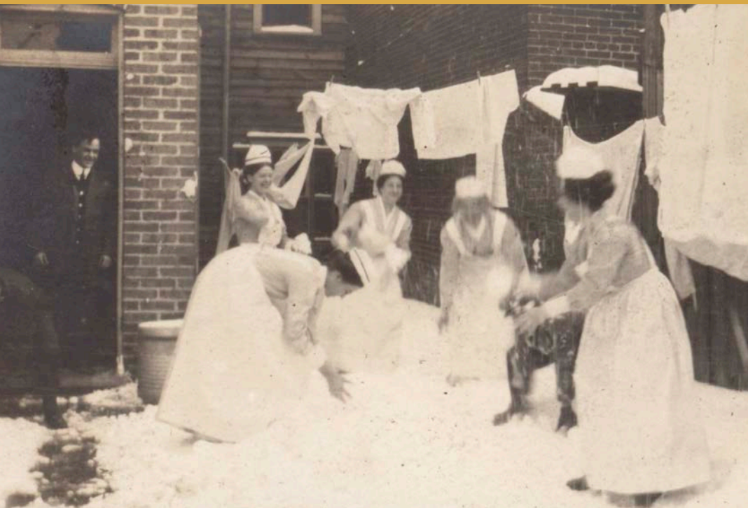
A snowball fight erupts during duty at Winchester Memorial Hospital, ca. 1912.

© 2026 by the Rector and Visitors of the University of Virginia