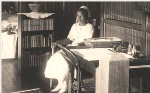
A nurse at Iloilo Mission Hospital, ca. 1921.

Both of these collections are the raw materials of history, carefully safeguarded for a new generation of researchers in the Bjoring Center. ●