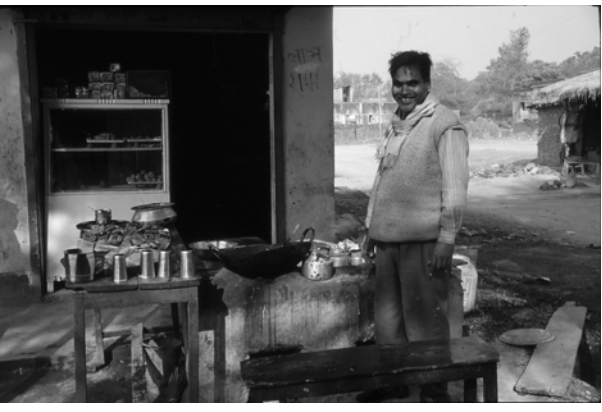
Tea shop near the clinic.

(Continued from page 1) arrived in Giridih on the evening of January 23, after more than 24 grueling hours of travel, the members immediately began screening the more than 450 patients who had awaited their arrival. The