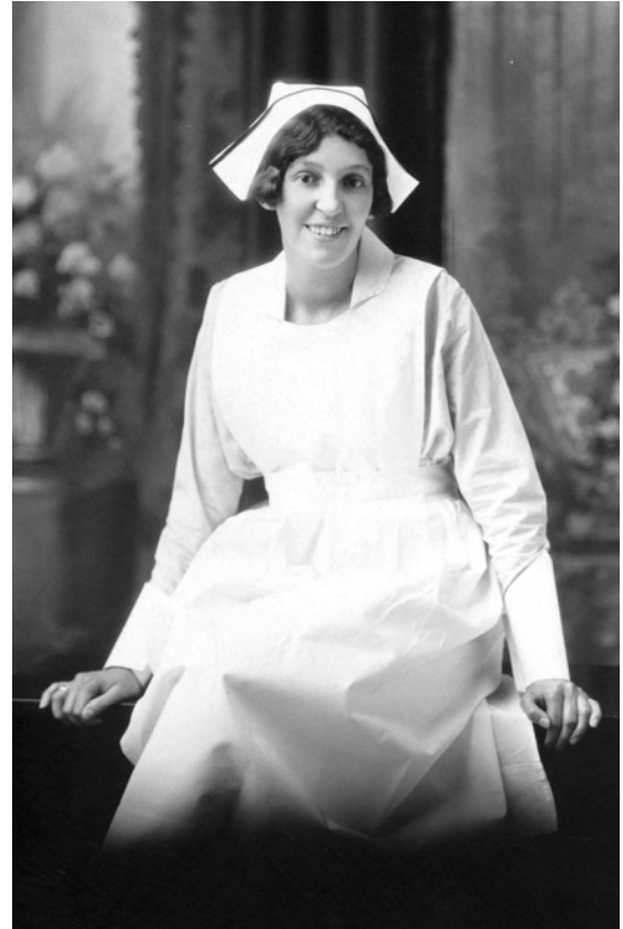
Private duty nurse, ca. 1920s.

It is necessary to keep all sights, sounds and suggestions of illness from other guests. If a nurse is alone with a critical case, it is impossible for her to be relieved for exercise or meals. She must eat from a tray in the patient's room and will not get a change of scene that is so restful. Even if ... relief is available ... the process of dressing for the dining room, order-