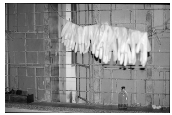
Surgical gloves carefully washed and saved by local nurses.