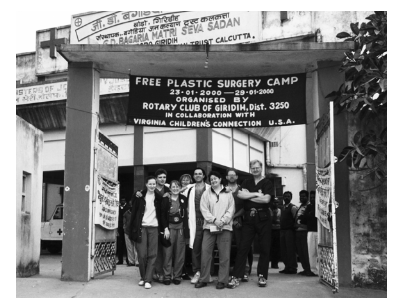
Virginia Children's Connection clinicians at Bagaria clinic.