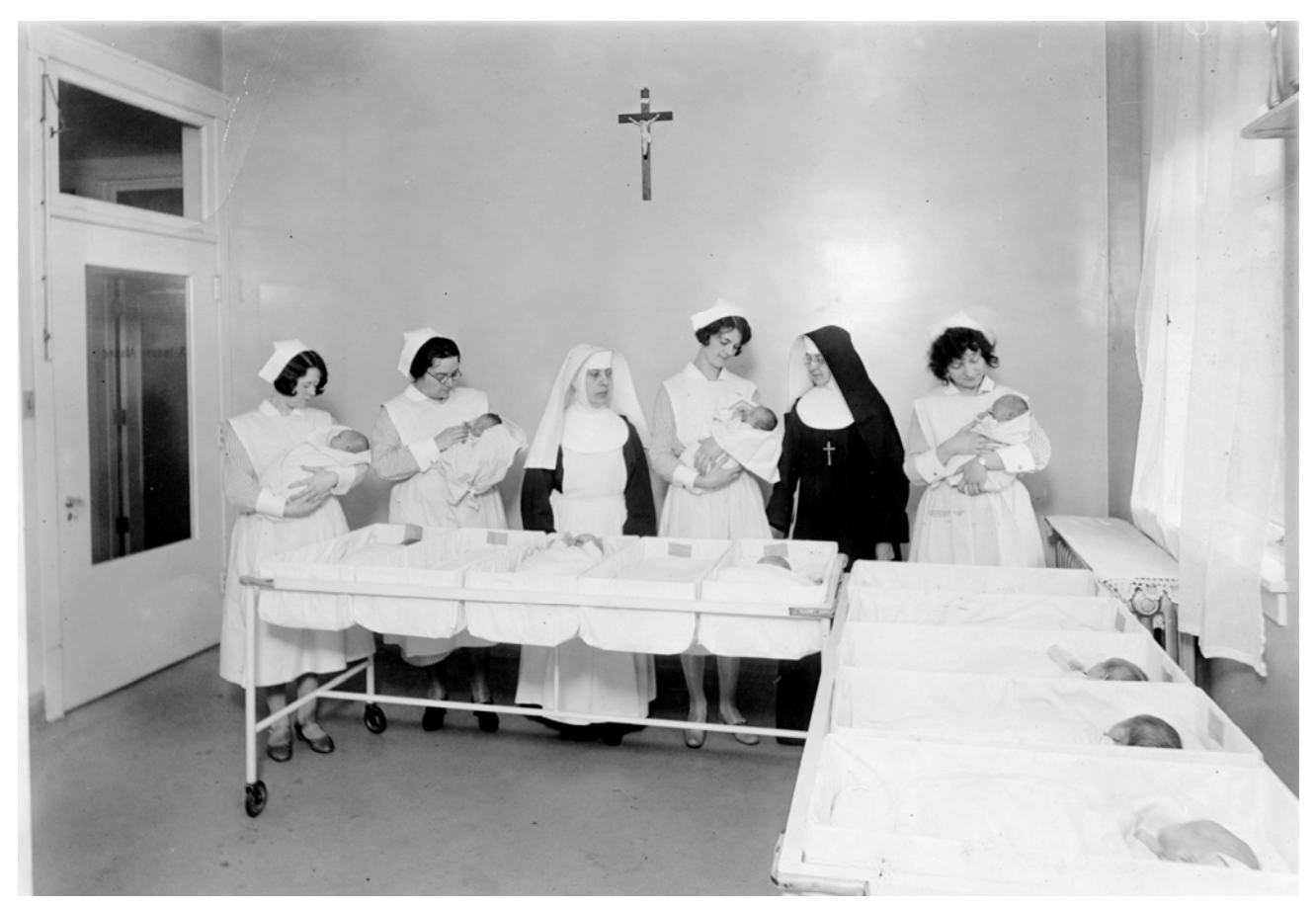
St. Charles Hospital, Aurora, Illinios, c. 1928-29.

NON-PROFIT ORG. U.S. POSTAGE PAID CHARLOTTESVILLE, VA PERMIT NO. 164