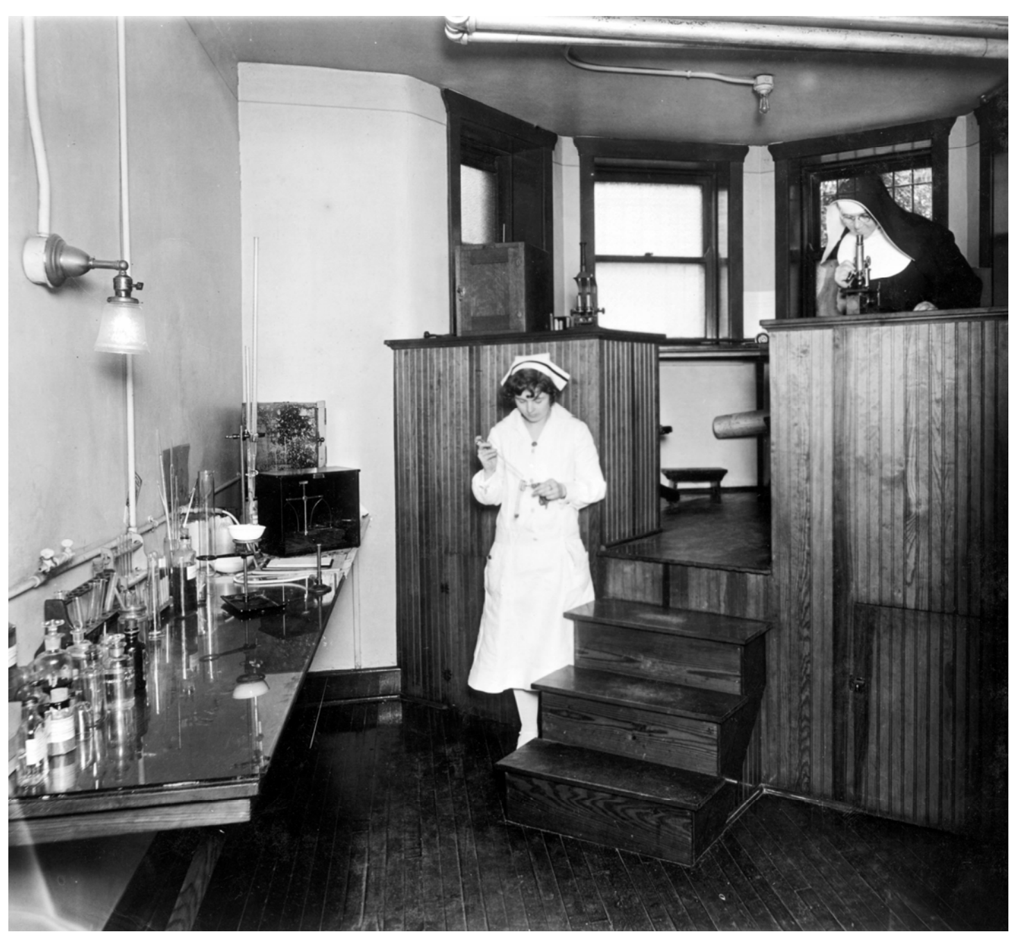
St. Charles Hospital, Aurora, Illinios, c. 1928-29. CNHI Stella Prombo Renaud Collection.