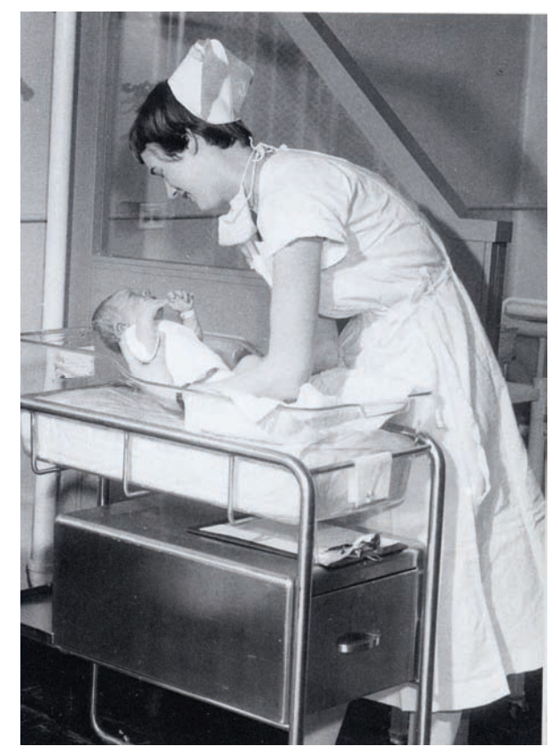
c. 1950s, CNHI photograph collection.