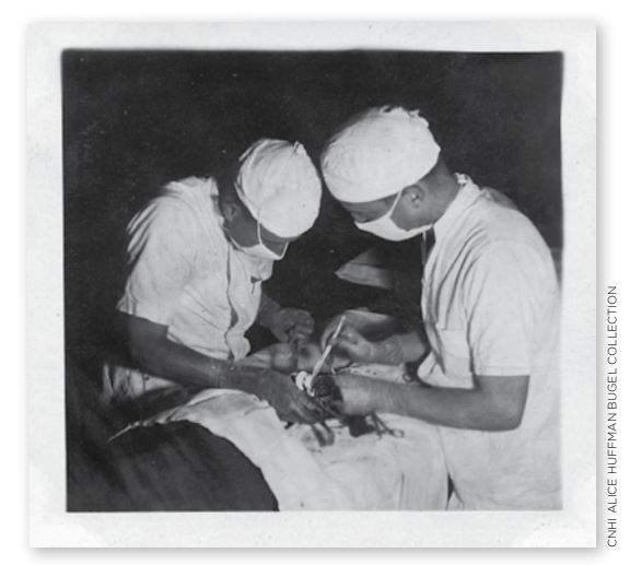
Surgeons at work.

After eventually obtaining additional necessary equipment, the 8th Evac established a fully functional field hospital at Caserta, near Naples, Italy from October to December, 1943. During this time, members of the unit worked together to devise new and innovative uses for equipment and improved methods for providing care. For example, German ammunition cases were converted into scrub sinks for the operating rooms.<sup>29</sup> Despite frequent air raids and blackout conditions, the morale of the unit was high. Kinser stated that "Most everyone [was] quite happy and pleased at [the] set up ... [the] meals [were] excellent and the cognac [was] very good."30 More than 7,000 hospital patients and outpatients were cared for in this two month period. The time at Caserta would later be considered "light duty" by the members of the 8th Evac in comparison to the work they