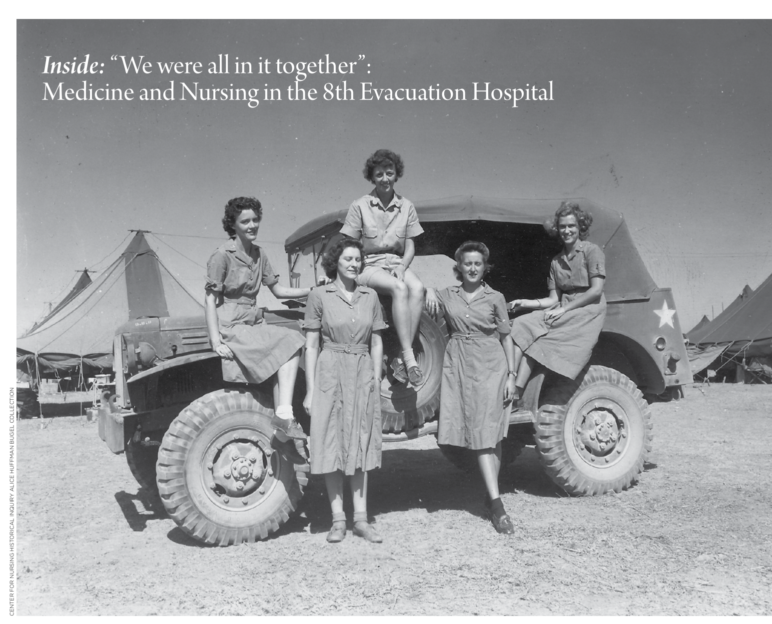
Members of the 8th Evacuation Hospital