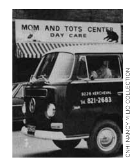
Mom & Tots Center Bus

the clinic as a "soul brother." As Milio noted: "The building was not to be touched as it belonged to the people there." Clearly, the neighborhood community was invested in the Center and did not want it destroyed. Thus, Milio's dream had come true: the new clinic, involving women from the inner city neighborhoods where she had first practiced public health nursing, had become a center where the women felt at home—where they felt supported