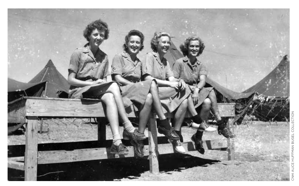
Members of the 8th Evac.

shock, hemorrhage, and infection.11 For those soldiers awaiting surgery, nurses were often called upon to provide lifesaving therapies such as intravenous fluids, oxygen, and prophylactic antibiotics while the soldier awaited surgery.<sup>12</sup> Post-operatively, patients recovered on a surgical ward and, once stable, would either be sent back to the United States for long-term care or if fully recovered were quickly returned to the frontlines.<sup>13</sup>