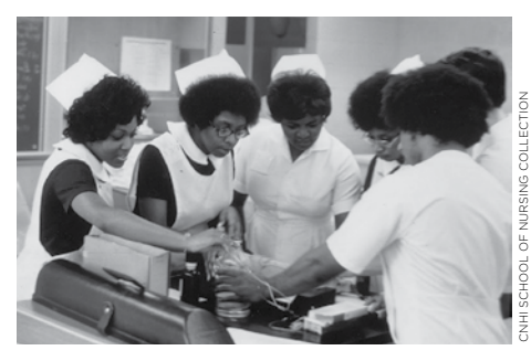
U.Va. School of Nursing students, 1971.

Accommodation of 100 rooms is reserved for conference delegates at the Hotel Koldingfjord, a four-star hotel located next to the museum. See www.koldingfjord.dk/gb. Those wishing to take advantage of this special rate should reserve accommodations before May 8, 2012. Regular prices for accommodations will apply after this date. Bookings of rooms are now open. When booking, please notify the hotel that you are attending the International Nursing History Conference. Further information about the conference fee and program will be available when registration for the conference opens on January 16, 2012 on the conference website, www.dsr.dk/dshs.