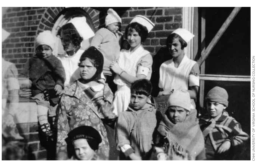
U.Va. pediatric patients taking the air, c. 1920s