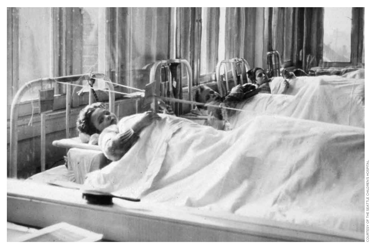
Patients at Seattle General Hospital, 1907

Seattle's hospital facilities at that time were limited and largely served adults; religious sisters provided charity care, and there was a hospital for county indigents and a pest house for contagious cases.<sup>2</sup> This left no designated place for children whose surgical and orthopedic needs went unmet. Children lacked care for crippling disorders such as tuberculosis of the bone and joint, congenital abnormalities, infantile paralysis, rickets, and other deformities.<sup>3</sup> Without designated providers who had the knowledge and skill to treat them, these children would never meet their full potential as productive citizens.