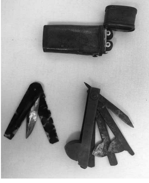
Artifacts from the American Civil War include instruments used for bloodletting. Artifacts 01282 (case with 4 lancets), 01325 (single lancet), & 01104 (4 bladed fleam)

using a bistoury (a surgical knife with a long, narrow, straight or curved blade) or a lancet. Scarification created multiple short and shallow incisions at the site of inflammation with the use of a lancet, bistoury, or scarificator (an instrument consisting of numerous blades). Cupping was performed with the use of small glasses.8 In dry cupping, no blood was actually extracted; the heated cup was drained of air and upon application, the skin would swell. The formation of the raised blister from swelling allowed wet cupping in which incisions were made, and blood and fluid were removed.9 Leeching employed fresh-water parasitic