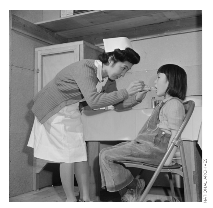
Granada Relocation Center in Amache, Colorado

historical trauma can override the health benefits accessed in the short-term.