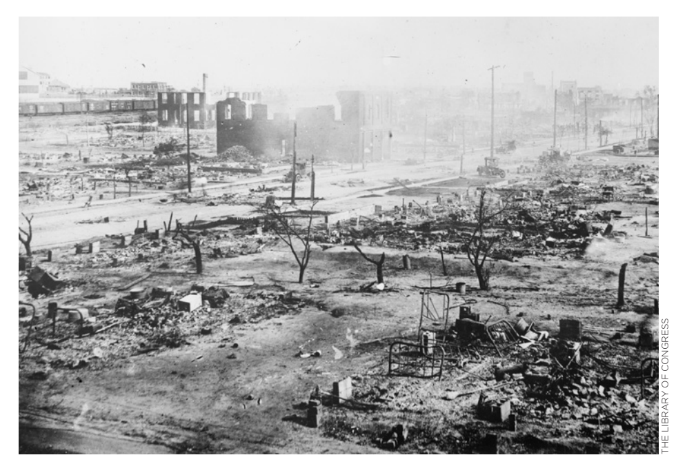
A Black neighborhood in ruins after the Tulsa riot, June 1921

FOLLOW US ON: facebook.com/uvanursing and twitter.com/BjoringCenter