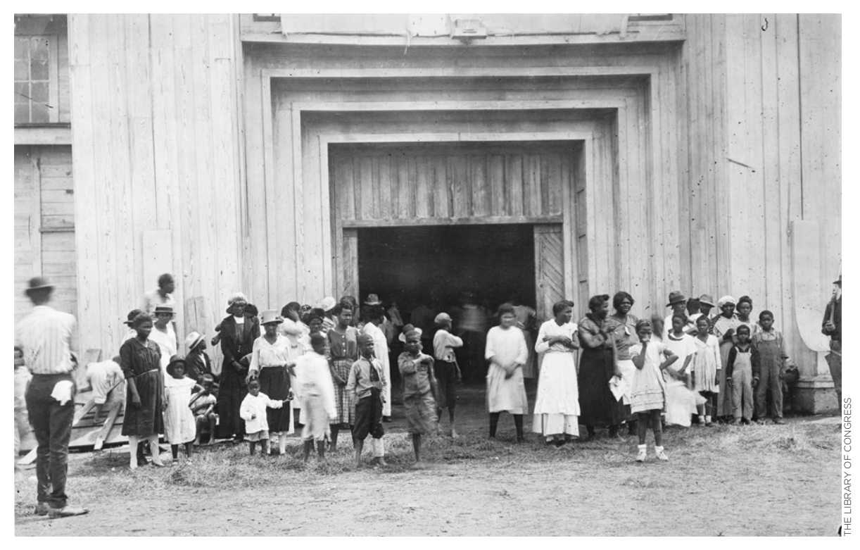
The county fairgrounds became a refugee camp in the aftermath of the riot.

Greenwood's Black residents and marched them through the streets at gunpoint with their hands held above their heads. The Guard detained them in holding centers at the Convention Center, the local ballpark, and the fairgrounds while white rioters continued to loot and burn the Black residents' property. National guardsmen also disarmed whites and, while some were arrested, most were merely sent home. In the wake of the riot, 35 square blocks and 1,200 Greenwood homes and businesses lay in ruins. According to the 1921 Red Cross Disaster Report, at least 300 people died, mostly Black citizens, although the accuracy of the deaths is still contested. 4 The Black hospital burned, as did the theatre and offices of the Black newspaper, The Tulsa Star.