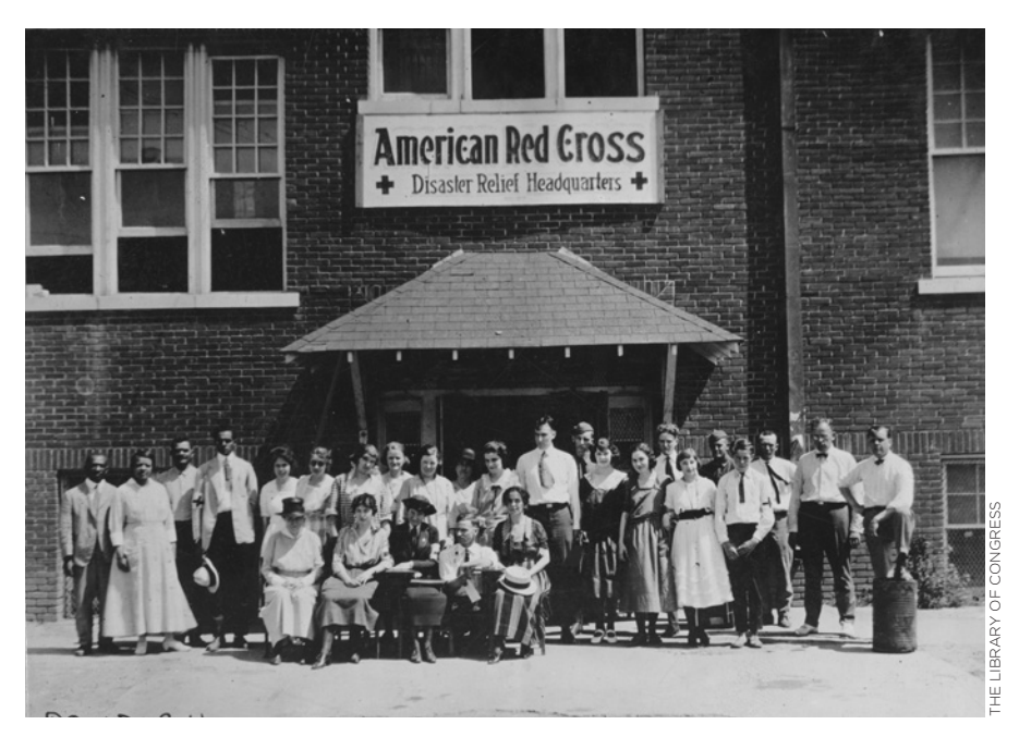
Red Cross headquarters in Tulsa, 1921

When I started reading stories by Blacks, I read stories of trauma. They reveal the emotional impact of having one's own community destroyed and having to run for their lives.