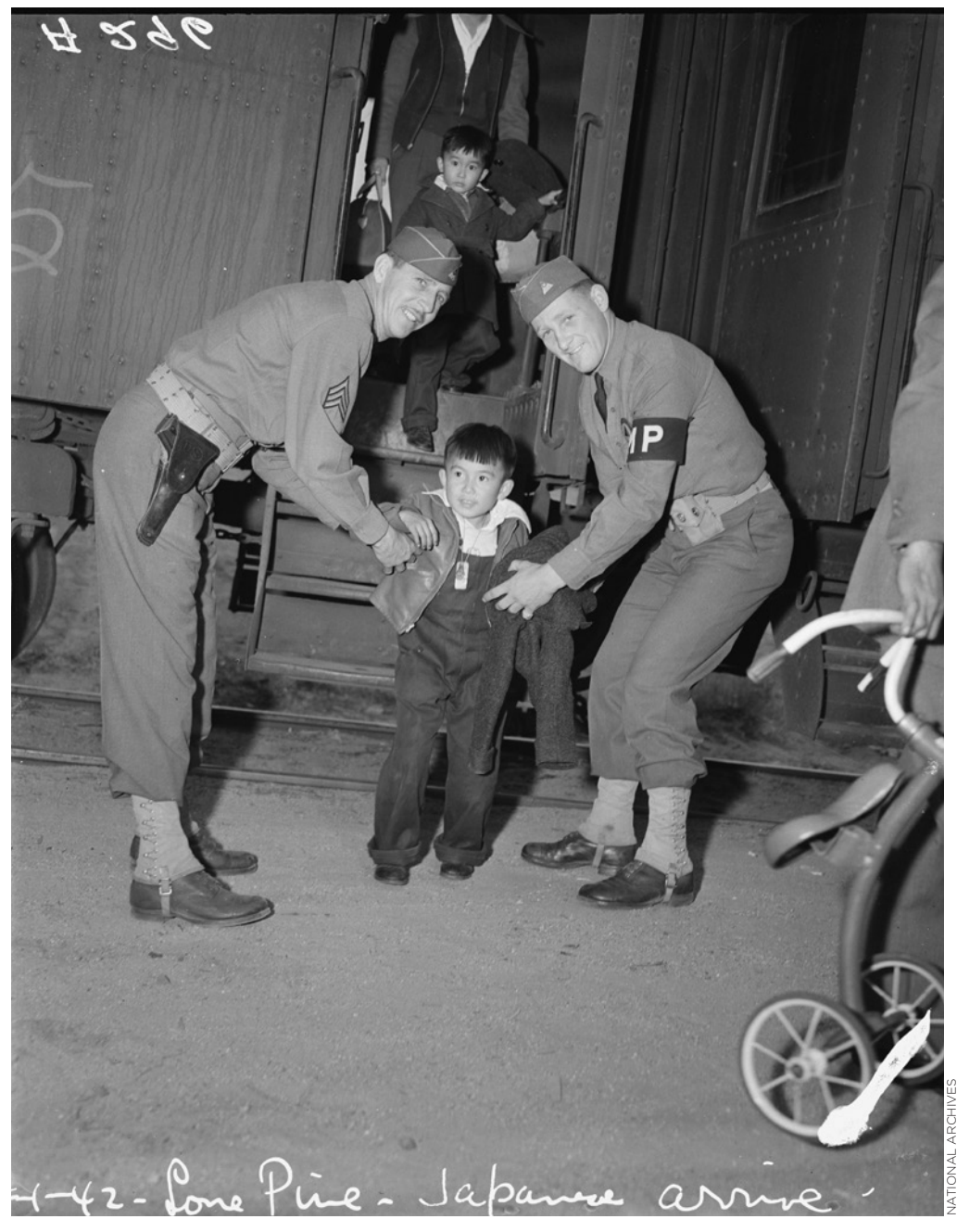
Children arriving by train in Lone Pine, California, 1942

western states. Generations of Japanese Americans' lives were forever changed.