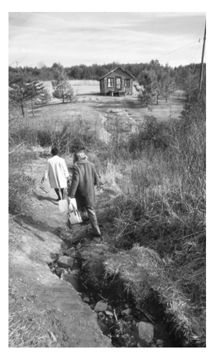
UVA nurse practitioners working in rural Virginia in the 1970s

he question of accessible and affordable healthcare has prompted lively debate for many decades, and shows no signs of retreating. Nurse practitioners are a significant part of the answer. In the 1960s, newly formed nurse practitioner programs established academic credentialing for a cohort of nurses ready to offer high-quality, economical