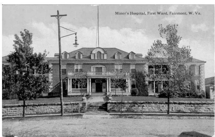
Postcard of Miner's Hospital No. 3, Fairmont, W.Va.

Within the first twenty-four hours, the Fairmont Coal