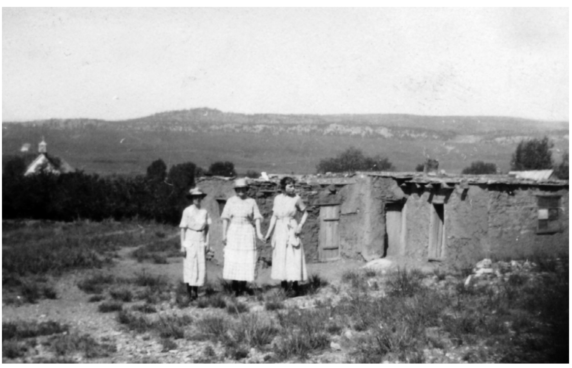
Nurses from the American Red Cross Department of Nursing on home visit near Las Vegas, c. 1921.

NON-PROFIT ORG. U.S. POSTAGE PAID CHARLOTTESVILLE, VA PERMIT NO. 164