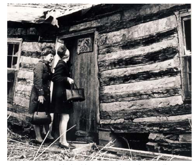
Public health nurses making a house call.

The LA clinic scene is also similar to that outside of a nursing clinic in the 1930s in Appalachia where hundreds of impoverished citizens of Leslie County sought well baby checkups, immunizations, and treatment for cuts and bruises, gun-shot wounds, heart failure, and infectious